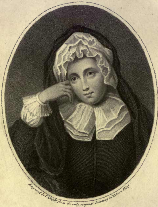
LADY RACHAEL RUSSELL.